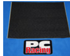
PC10X for DIY